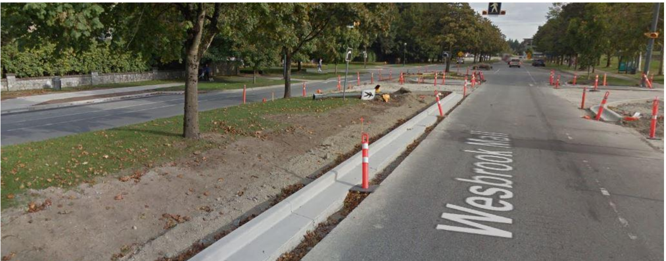
Location 3 & 4