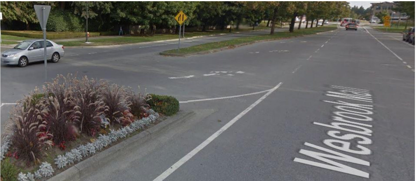
Location 5 & 6